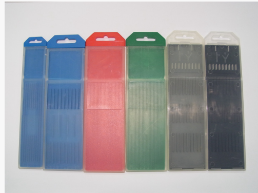
• Plastic box (Flip-down / Flip-Up)